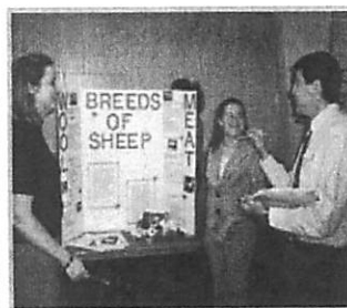
Exhibit should be able to stand alone and convey a complete message to audience